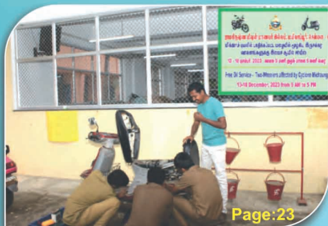
220 Two Wheelers in Chennai city damaged during Dec-2023 floods—repaired and serviced by our Polytechnic College Students.