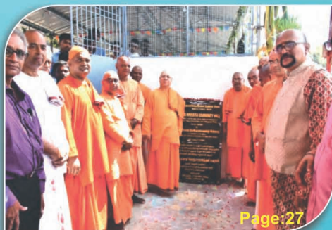
Sister Nivedital Community Hall inauguration at Alapakkam on 17-02-2024