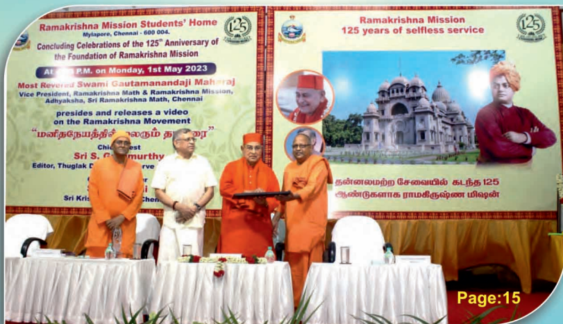
Ramakrishna Mission 125th year celebration on 01-05-2023